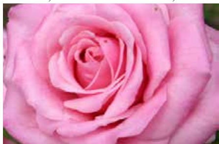
Above: 'Belinda's Dream'