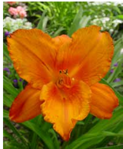
Daylily 'My Reggae Tiger'