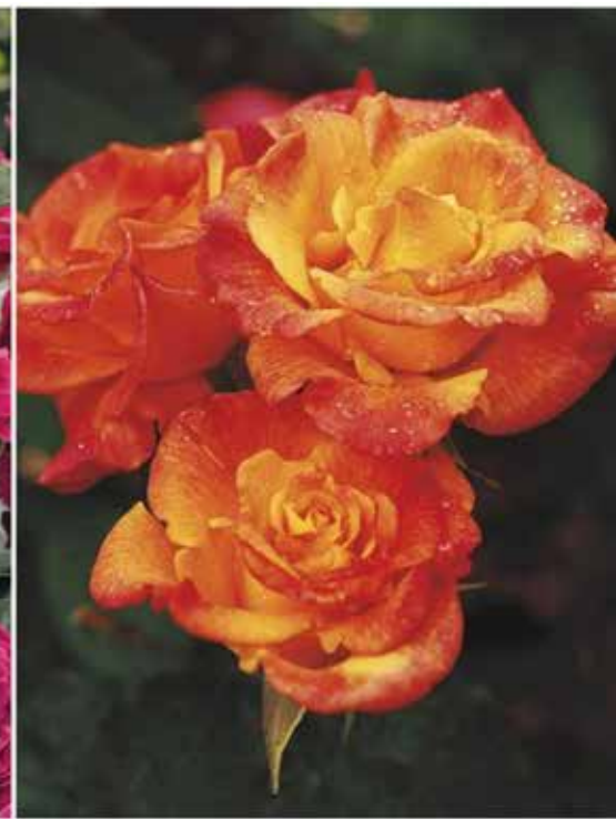
L to R: All Dressed Up™, Celestial Night™, 'Rio Samba'