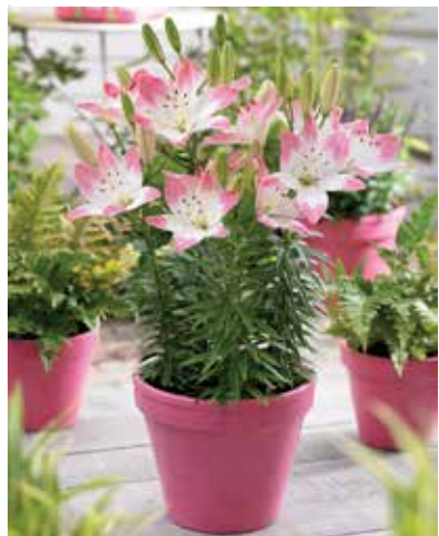
Asiatic Lily 'Sugar Love'