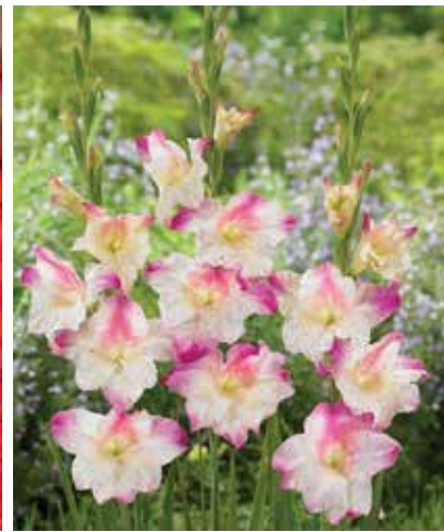
L to R: Alocasia 'Mojito', Gladiolus 'Mon Amour', Gladiolus 'D-Day', Gladiolus 'Frozen Sparks'