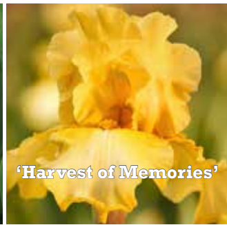
'Harvest of Memories'

Our specialty bearded iris collection presents an opportunity for experienced collectors and new gardeners alike. If you currently grow bearded iris, you probably love them for their evergreen, drought-tolerant foliage, luxurious spring blooms and easy care attitude. If you don't have any in your garden, consider one (or more!) of the following to add some 'wow' factor to any sunny garden location with good drainage: If you're craving a bold statement, consider 'Gypsy Lord,' a tall variety reaching up to