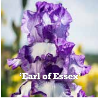
'Earl of Essex'