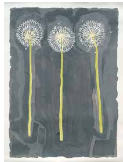
Pictured right: 'Giant Dandelions' watercolor on paper, 30"x40", by Martha Burkert

A free, casual reception to view the latest collection and meet the artists in person. Work is on view and available for purchase until September 9 th .