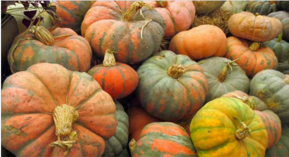
Pumpkin varieties clockwise from above: 'Speckled Hound,' 'Choga,' 'Millionaire' and 'Washed & Waxed' Gourds.