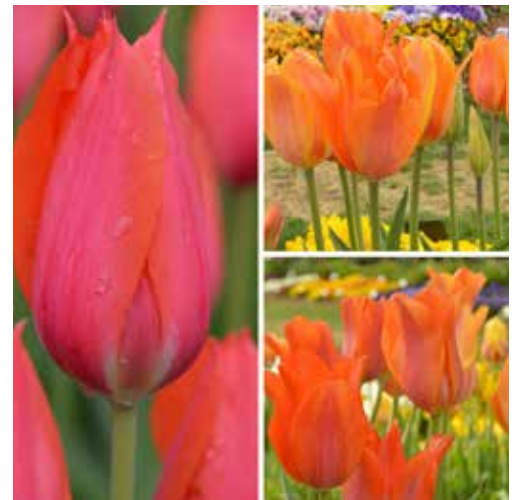
Spring Embers (above): 'Temple of Beauty' 'Temple's Favorite' and 'El Nino.' Spring Peonies (left): 'Angelique,' 'Orange Angelique,' 'Wedding Gift,' 'Mount Tacoma.' Spring Awakening (right) a Viridiflora tulip collection

NHG Spring Peonies: Not many things say 'spring' like these luscious, peony-shaped flowers. This collection is soft, sweet and elegant in shades of pink, rose, white and peach. You'll wish spring would never end when these beauties are gracing your landscape. This show-stopping blend comes with 100 bulbs per bag. Make sure you select your favorites early! And remember—when you purchase $100 or more on bulbs, we'll store them at the proper temperature for free and call you when it's time to plant!