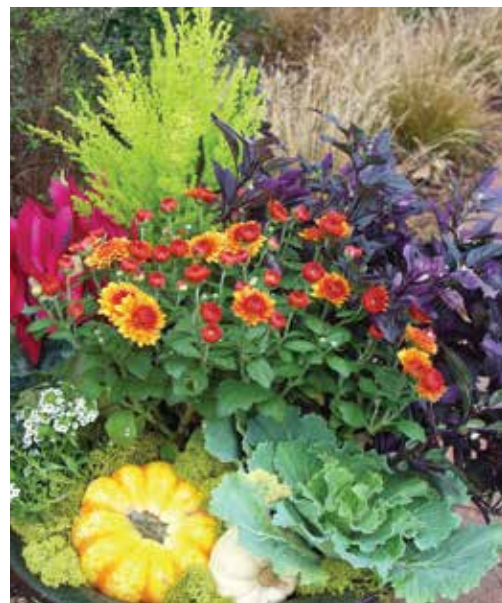
Fall mixed containers bring the season to your doorstep.

What to take away from all of this? We at NHG want you to have success with all that you grow, and with an increased focus on the health of your soil and the proper timing of your plantings, you will!