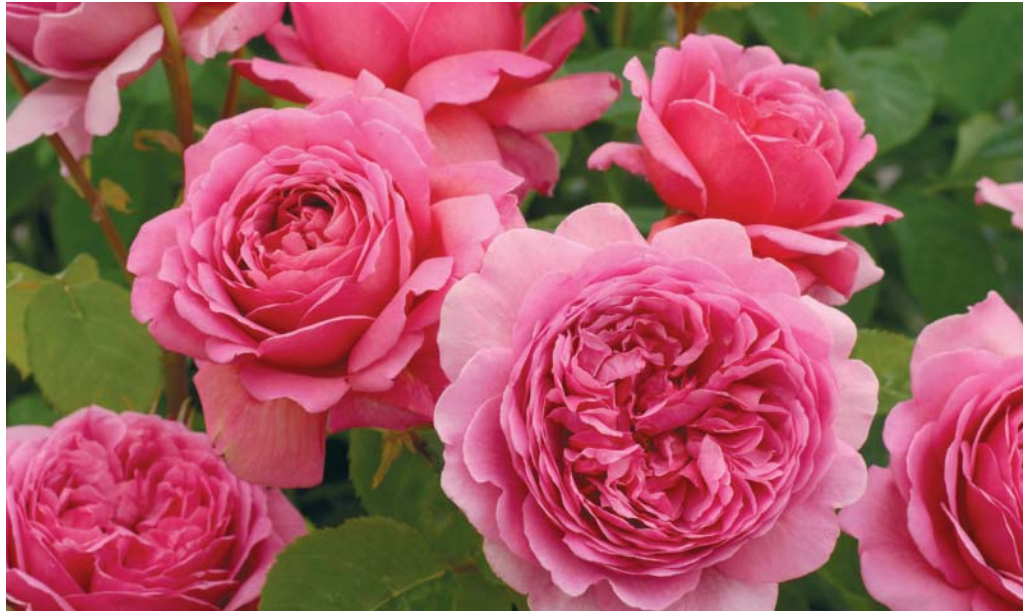
Above: 'Princess Alexandra of Kent.' Banner: 'Munstead Wood.'

English roses evoke a sense of romance and old-world charm. Bred through crosses of antique and modern rose varieties to achieve graceful characteristics and fragrance, they're among the most beautiful roses you can grow. We've increased our selection of varieties that we're growing on for our annual Rose Weekend, this year scheduled to open Saturday, March 7 th . Each of the 20 varieties of English roses we're offering has been selected for success in our area, and most of them have been through landscape trials here. Highlights include: 'Princess Alexandra of Kent' is a David Austin® recommended variety named for the cousin of Queen Elizabeth II. It is a vigorous repeat bloomer that grows to about 3' x 3'. With a sumptuous pink color and rich tea rose fragrance, it's a favorite pick this year.