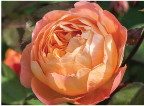
'Lady Emma Hamilton'

English roses evoke a sense of romance and old-world charm. Bred through crosses of antique and modern rose varieties to achieve graceful characteristics and fragrance, they're among the most beautiful roses you can grow. We've increased our selection of varieties that we're growing on for our annual Rose Weekend, this year scheduled to open Saturday, March 7 th . Each of the 20 varieties of English roses we're offering has been selected for success in our area, and most of them have been through landscape trials here. Highlights include: 'Princess Alexandra of Kent' is a David Austin® recommended variety named for the cousin of Queen Elizabeth II. It is a vigorous repeat bloomer that grows to about 3' x 3'. With a sumptuous pink color and rich tea rose fragrance, it's a favorite pick this year.