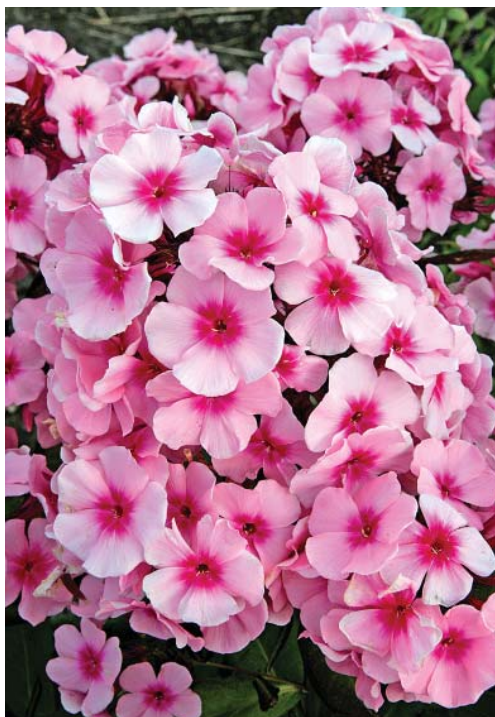
Gorgeous perennial Phlox paniculata 'Sandringham.'

See our events calendar for classes on how to choose and plant these treasures, then wait for the warmer weather to reveal their beauty!