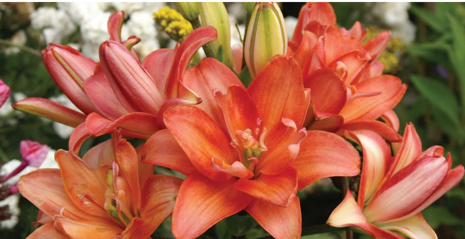
Early blooming Asiatic lilies like double 'Aphrodite' make wonderful, long lasting cut flowers.