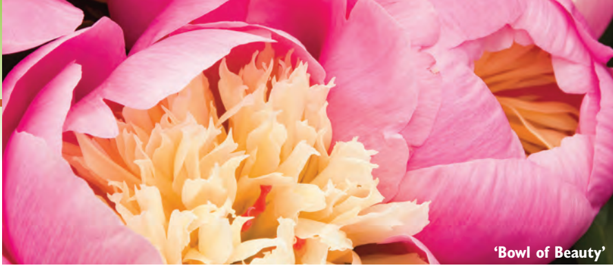
'Bowl of Beauty'