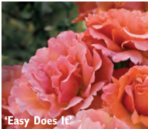
'Easy Does It'

Large billowing flowers open in spring time in a range of pinks, coral-peach tones, deep reds and creamy whites. Many have a lovely, bright yellow center. Stunning and long-lived specimen plants in the garden, the blooms are excellent for cutting. Distinctive foliage is another desirable attribute of peonies after the flowers have finished. Peonies are available at NHG in early spring and can be successfully planted while mostly dormant with new shoots emerging. Before planting, soil should be amended with compost or composted cow manure. Fertilize regularly with organic Espoma Holly-tone® to balance soil pH. Wire peony rings provide support to the heavy flowers. To thrive in the extremes of Texas, an ideal location is an eastern exposure, which provides a good amount of morning sun as well as shade from the afternoon heat. Peonies are limited in quantity so be sure to come in and choose your favorite colors early.