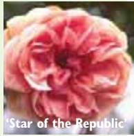
'Star of the Republic'

Texas Pioneer Roses are tough beautiful garden roses. These roses are crosses between very disease resistant roses and large flowered roses, and are named for historically significant Texas people and places. The resulting new class of roses is tough and resilient. They come in a broad range of colors and present exciting new possibilities for landscape roses in our North Texas gardens. We will have many varieties to choose from. The following are some of my favorites. 'F. J. Lindheimer' has peach-colored, fragrant flowers on a 3-4' shrub.