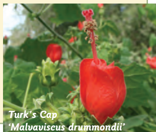
Turk's Cap 'Malvaisiscus drummondii'