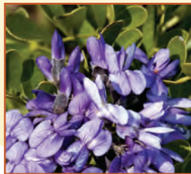
Texas Mountain Laurel