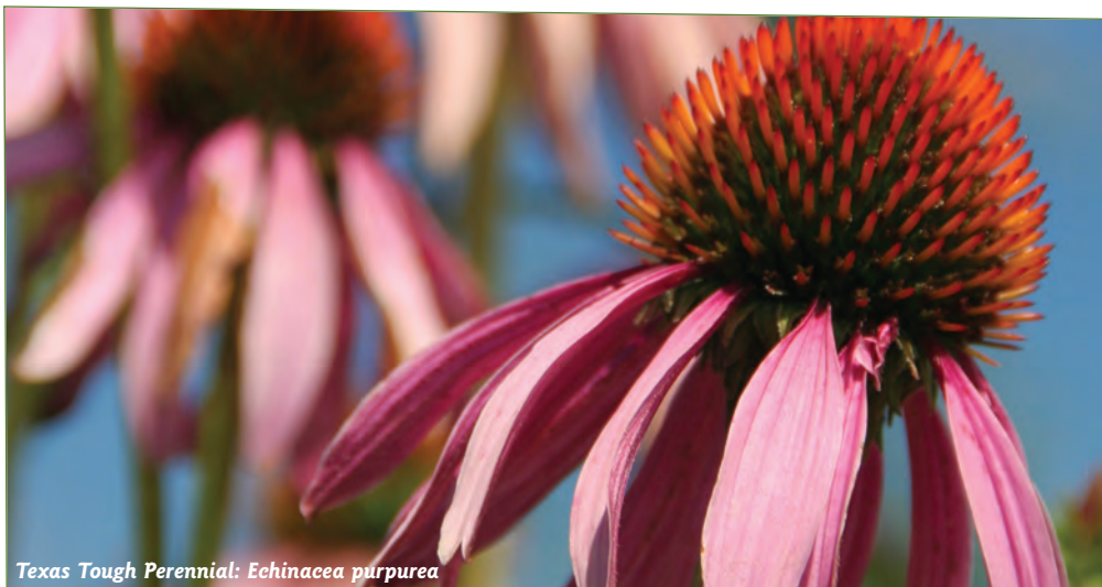
Texas Tough Perennial: Echinacea purpurea