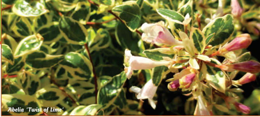
Abelia 'Twist of Lime'