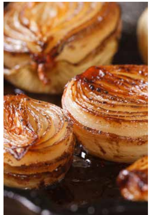
Delicious, savory onions are as easy as 1, 2, 3.