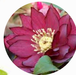
Clockwise from left: 'Red Sapphire,' 'Golden Lotus' and 'Berry Swirl.'