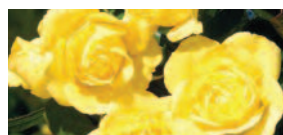
'Walking on Sunshine' All American Selection 2011 Floribunda

Other timely rose tips suggestions: Mulch at least 2" in your rose beds; add Epsom salts in Feb.; prune roses in February around Valentine's Day and attend our FREE Rose Class February 5th at 1pm to learn about proper pruning and the best rose-care tips!