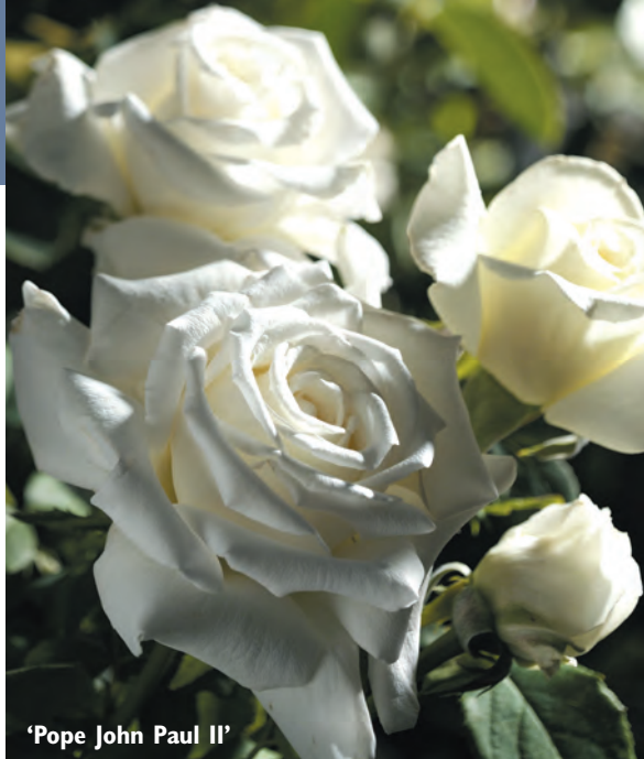
'Pope John Paul II'