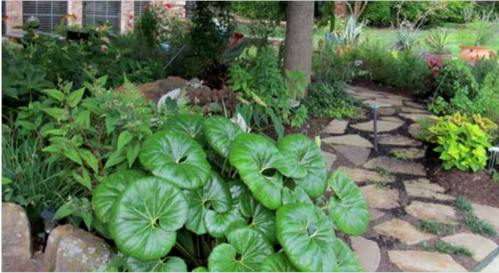
Lush shade plantings like Farfugium japonicum 'Gigantea' use far less water than lawns.

Certified Texas Master Gardener Paula Spletter has crafted a lush, eclectic garden in north Texas that's as thrifty with water as it is generous with beauty and interest. Not all water-wise gardens are sparse xeriscapes, and they don't all rely solely on gravel and cactus. "It was created out of necessity when the trees we planted grew so large that they shaded the grass, making it difficult to grow" says Paula. "I removed the remaining plantings and started with a clean slate. Mapping out flagstone paths was the first item of business,