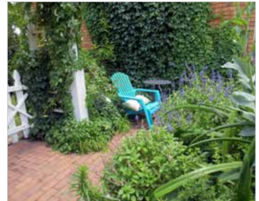
The entire landscape is filled with thriving plants and places to observe and enjoy.