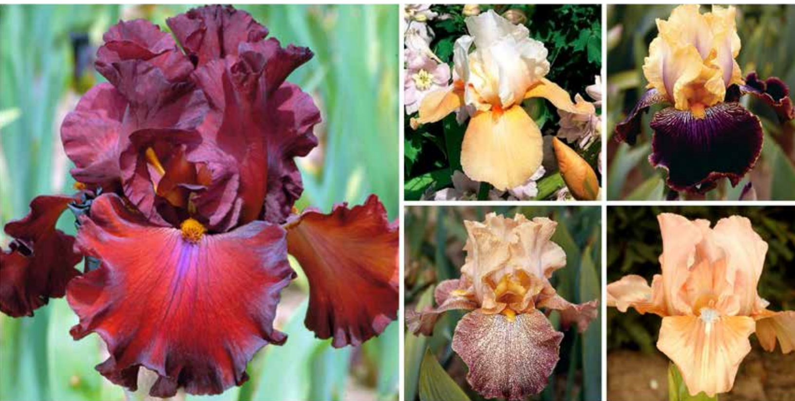
Clockwise from left: 'Grateful Red,' 'Invitation,' 'Devil's Riot,' 'Purr,' and 'Tanzanian Tangerine.'