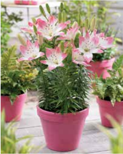
Asiatic Lily 'Sugar Love'