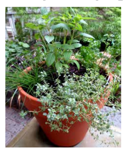
Free Class: April 27, 11am-12pm Hands-On with Herbs Grow the best herbs for your garden!

Save the date and join us to explore new choices of warm-season herbs with which to