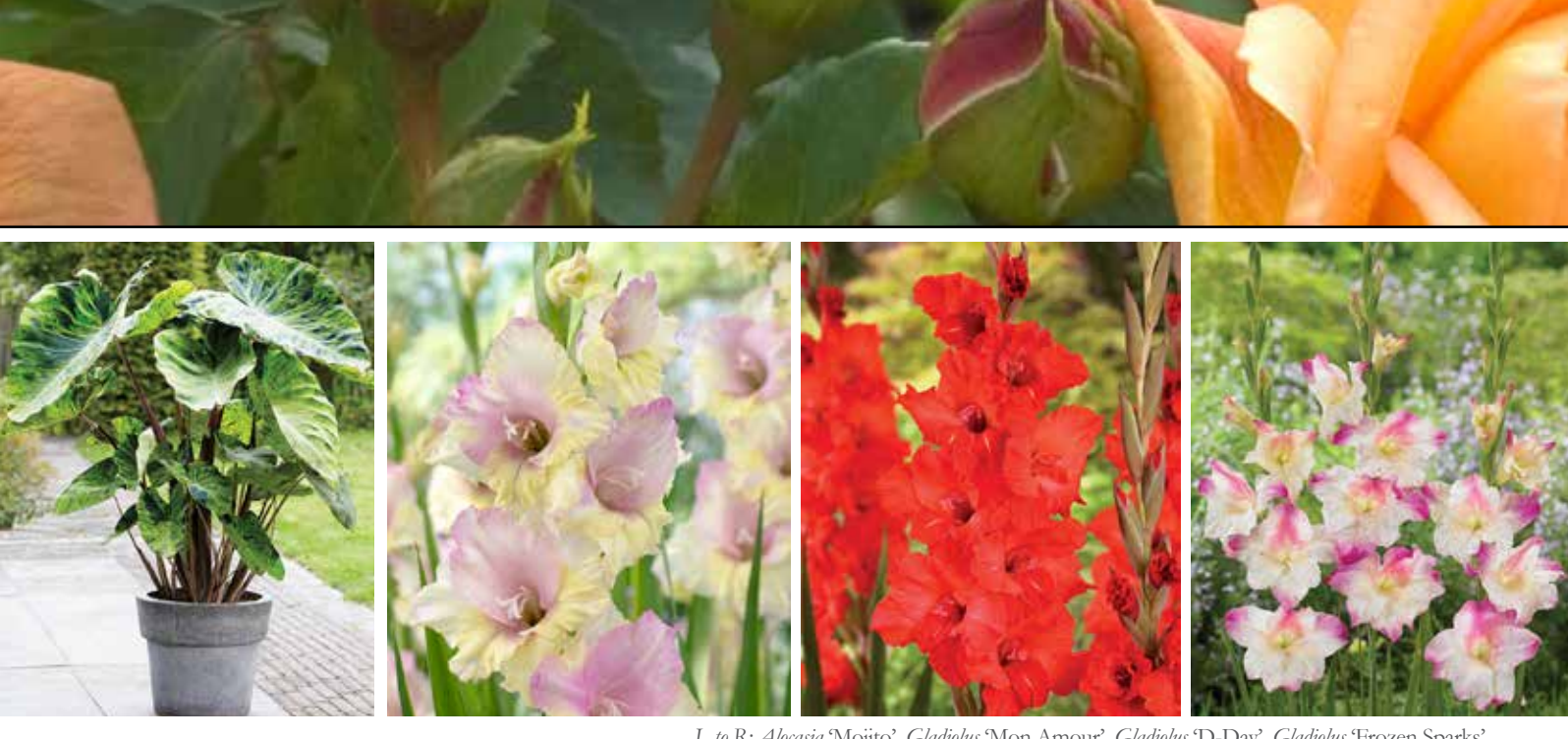
L to R: Alocasia 'Mojito', Gladiolus 'Mon Amour', Gladiolus 'D-Day', Gladiolus 'Frozen Sparks'