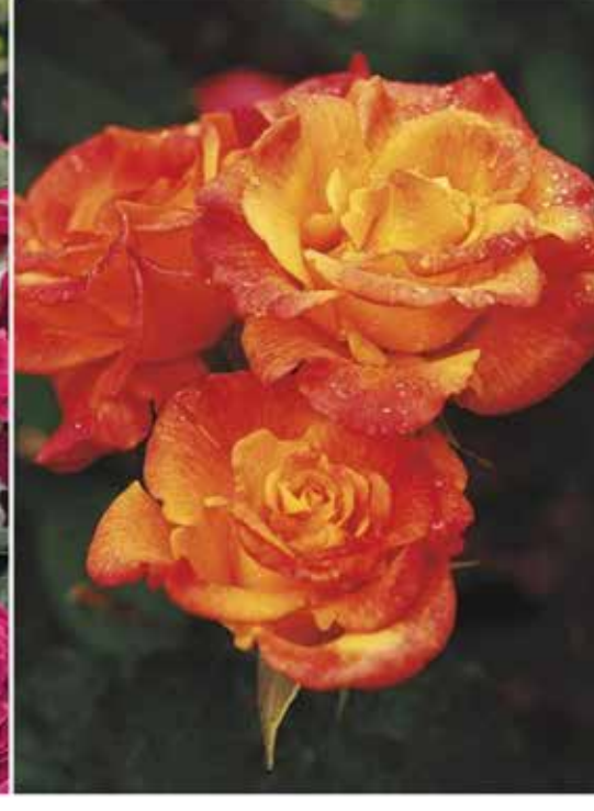
L to R: All Dressed Up<sup>TM</sup>, Celestial Night<sup>TM</sup>, 'Rio Samba'