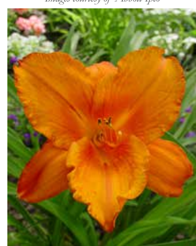
Daylily 'My Reggae Tiger'