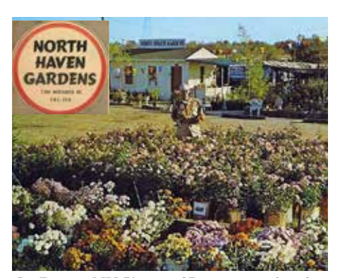
Ira Duncan, NHG's original Rosarian, stands with a collection of roses grown in nursery cans in what is now our front parking lot (circa 1965).

travel to Tyler to collect the blossoms to have on display in the store as a living example from which customers could choose. Orders were placed, the bare-root canes were brought in, and the shrubs were grown out here in Dallas in 'cans' (which in those early years were actual recycled food cans). Customers returned in March to pick up their shrubs, which were then ready