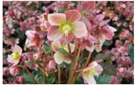
Above: Helleborus 'Merlin' Left: Helleborus' Maid of Honor

interest and structure to shady garden spaces. Most hellebores reach 12"-24" in bloom, so they're perfect for the perennial border or that special focal container garden. They're tough plants that can tolerate plenty of sun in winter; however, they'll need afternoon shade in hot summer months. We'll have quite a selection of varieties in stock now through early spring, with each variety having a unique bloom period now