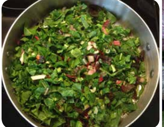
Chop the leaves as well as the stems of Swiss chard in a quick sauté with salt and pepper for a delicious, healthy treat.