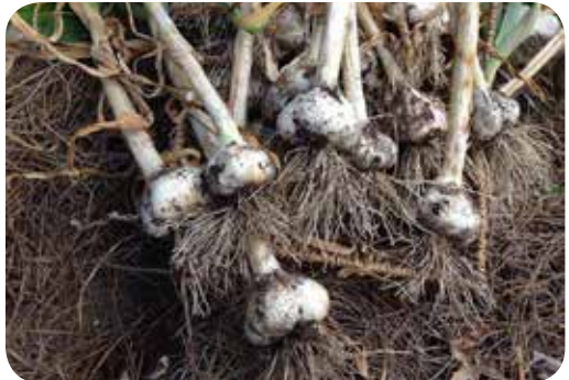
Garlic cloves and shallots are best planted in October. Harvest the bulbs in spring.