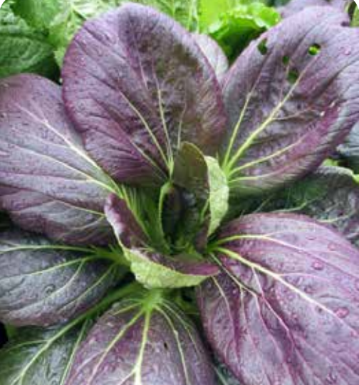
A super easy crop that packs a punch of nutrition. Start kale in fall and grow successive crops through early winter and spring. Broccoli, cauliflower and Brussels sprouts thrive in the cooler months as well.