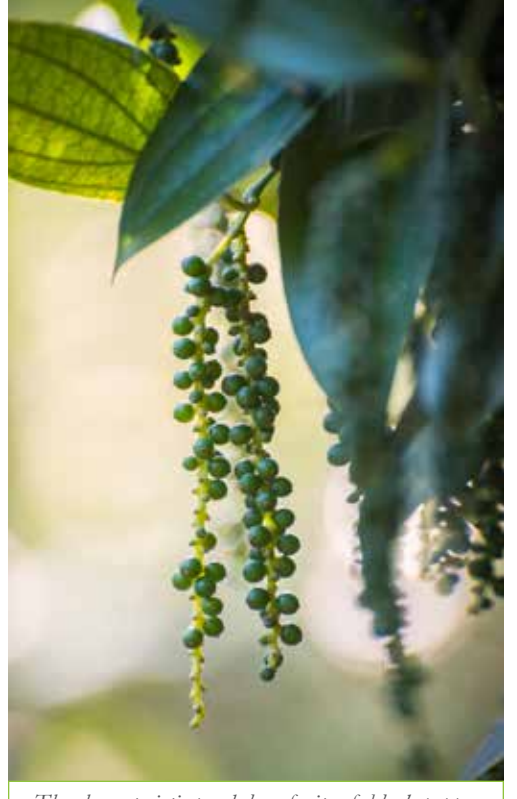
The characteristic pendulous fruits of black pepper are more potent when fresh.

The Café at North Haven Gardens is open Weekdays 11-3pm. Open early and offering breakfast items on weekends! Saturday 9am-3pm Sunday 10am-3pm