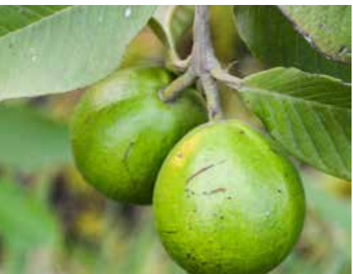
The unique flavor of Guava is easy to produce successfully in containers.