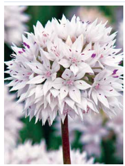
Clockwise from top: Allium 'Graceful Beauty,' A. christophii, Allium giganteum, and A. Purple Sensation' (Allium aflatunense).