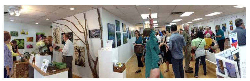
Gallery receptions will be held monthly in 2016.