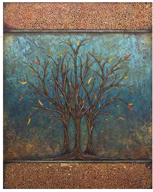
The Copperwood Forest at Night III by Kimberly Merck-Moore.