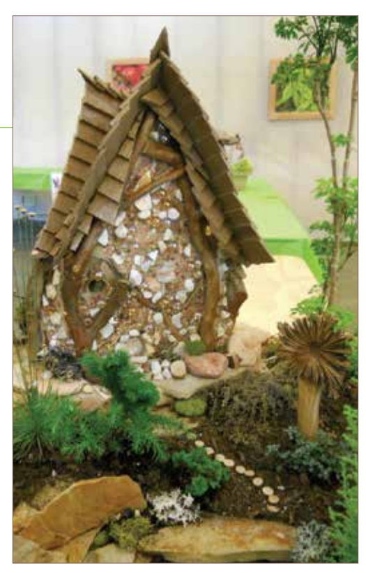
Get your creations ready for our annual October contest!

Fairy Gardens: Visitors from the Greener Realm Saturday, August 16th, 10-11:30am. Create worlds in miniature in this workshop designed for parent and child to have fun together and take home their own unique project. Materials for beginning your piece are included. Advance registration is required. Call 214-363-5316.