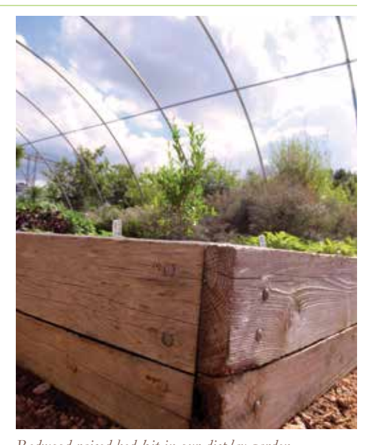
Redwood raised bed kit in our display garden. assembly to our recommended soil recipe. Check our calendar of events for these and other great opportunities—take a break from the heat and come learn from us here at NHG. See you in the comfortable (and air conditioned!) Gardener's Classroom.

For direct-seed crops, it's time to plant winter squashes and pumpkins outside through July. Summer squashes, cucumbers, and most beans can be sown outside for the second time this year. In late August, we'll be getting ready to start seeds inside or outside for most cool season greens, herbs, and cole crops like broccoli, Brussels sprouts and kale. Got seed shock? I've got quick primers planned for you in the form of POP UP classes in both July and August, covering fall seeding and other timely topics in a brief but informative setting so you can move on with your fall garden plans. First time with a fall vegetable garden? We've got your class. Our School of Gardening 102: Introduction to Home Veggie Gardening is for you, on Sunday, July 6th at 10am. I'll cover all kinds of vegetables with seasonal emphasis on what to do now. NHG redwood raised bed kits are a great way to grow so many things—and if you've never set one up, there's an informative how-to on Sunday, August 10th, where I'll show you how to do it, from