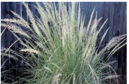
Lindheimer Muhly grass

Learn more at our class on Sunday, August 17th, 11am-12pm: Drying Out: The Drought Tolerant Landscape see our events calendar for details.