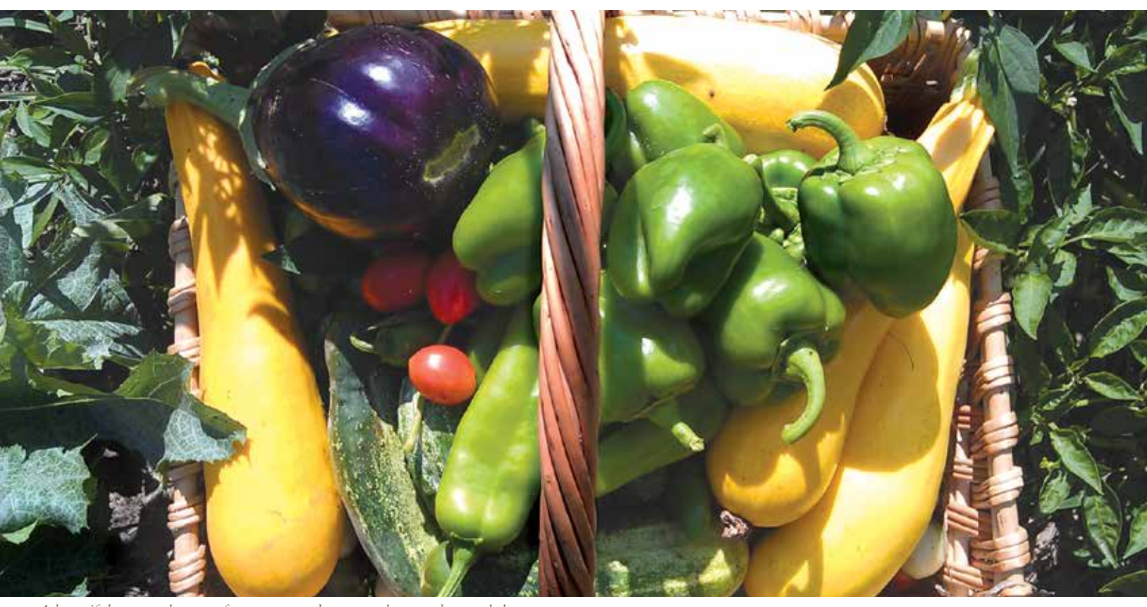
A bountiful summer harvest of peppers, eggplant, squash, cucumbers and cherry tomatoes.