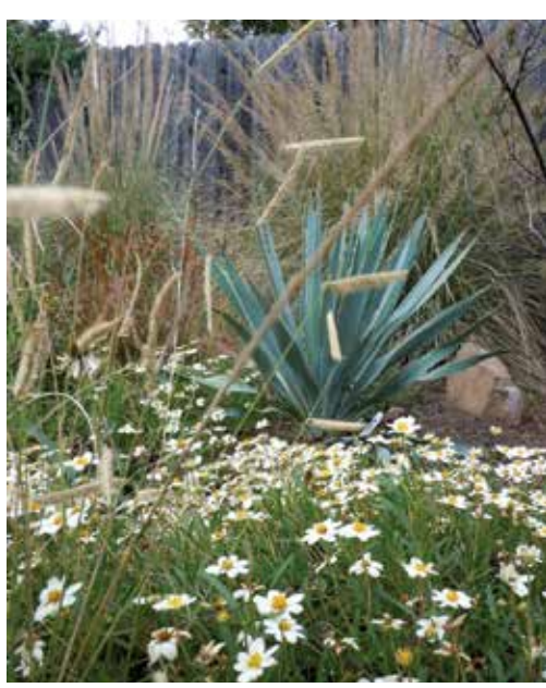
Note the horizontal "flags" of the Blue grama grass.