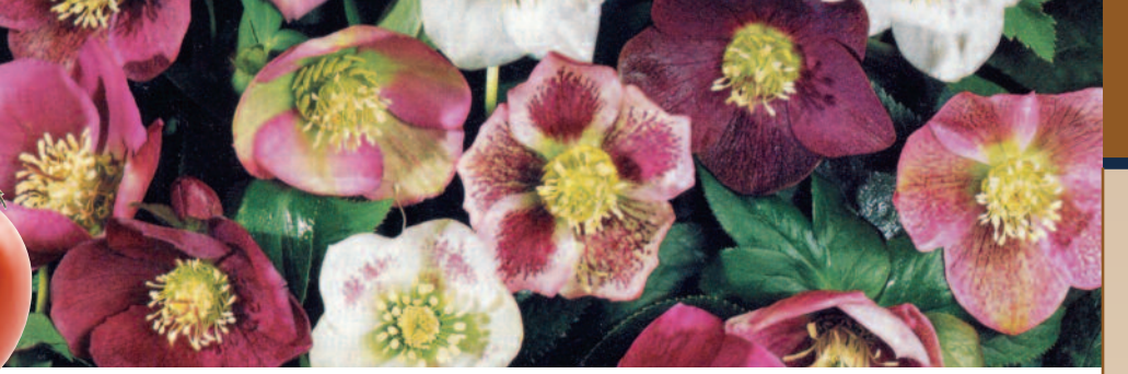
Hellebore sp. (Lenten Rose)